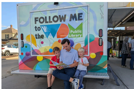
Ice Cream Party at the Kiosk, September 2024