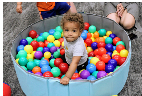
Babies on the Move, June 2025