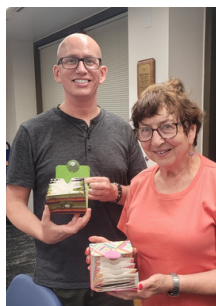
Adult Craft Night, August 2024