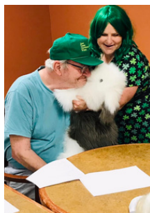
Senior Outreach, March 2025