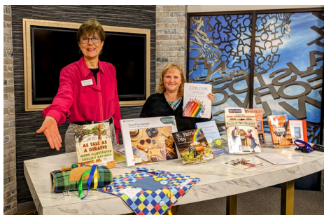
Featured on Iowa Live, March 2025