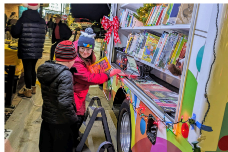
Jingle in the Junction, December 2024