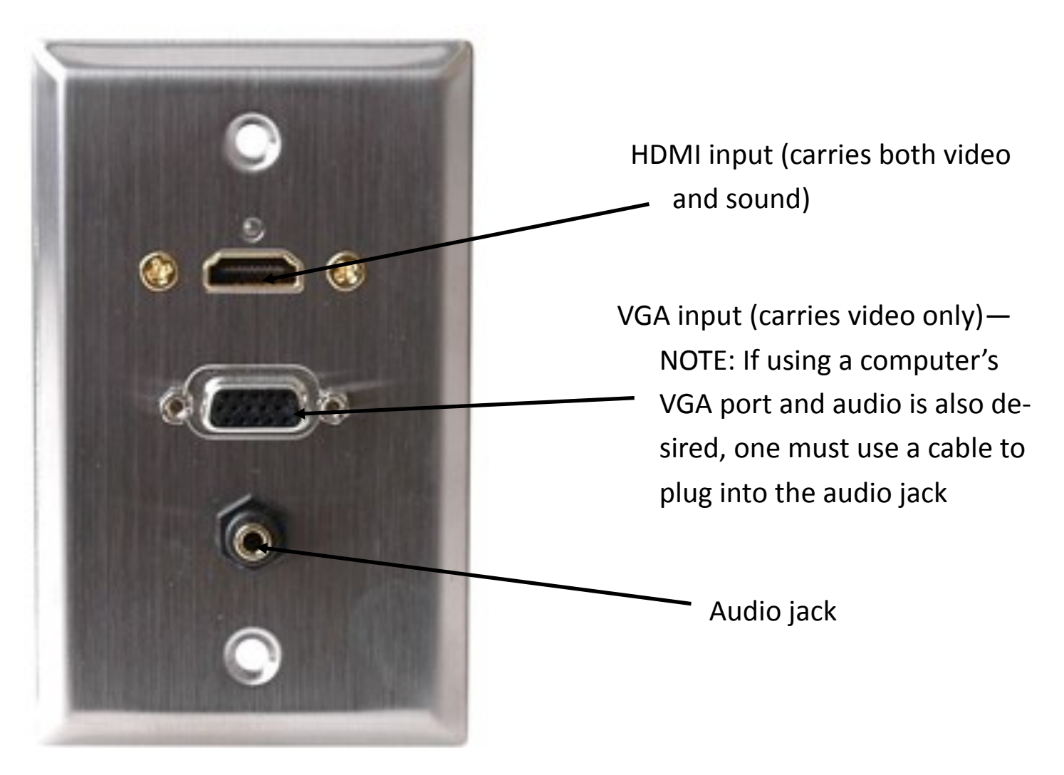
Input Panel Detail