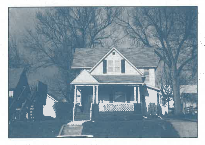
October 1934 - September 1935 First community library in Marge Herron's home 504 Sixth Street

In 1954, the library was relocated to a room in the new City Hall at 318 Fifth Street. Approval of a $77,000 bond issue allowed the Library Board to construct a separate facility in 1966. The prop-