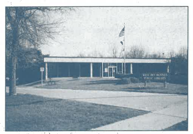
April 1966 - April 1996 West Des Moines Public Library 1105 Grand Avenue

erty at 1105 Grand Avenue was purchased from St. Mark Lutheran Church for $17,000, and a new 2,700 square foot public library was built, containing 20,000 volumes.